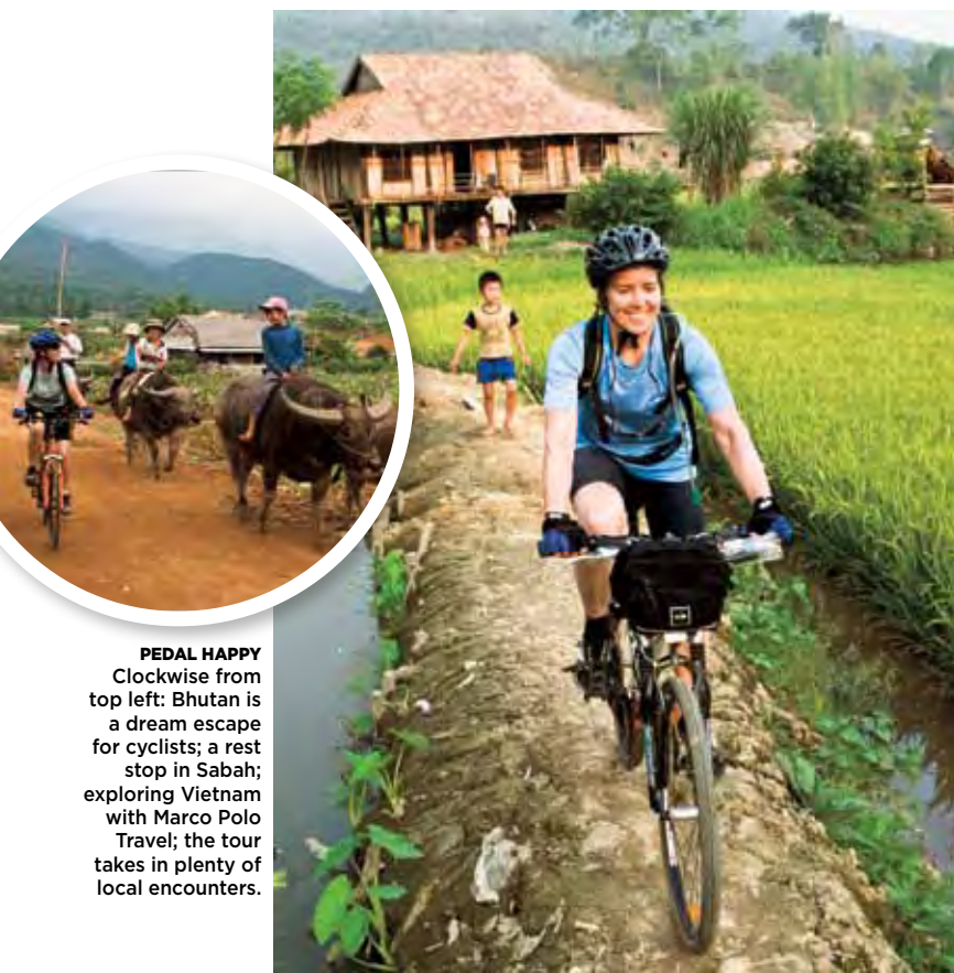
PEDAL HAPPY Clockwise from top left: Bhutan is a dream escape for cyclists; a rest stop in Sabah; exploring Vietnam with Marco Polo Travel; the tour takes in plenty of local encounters.

Even on the simplest of itineraries, you can combine cycling with a beautiful setting. That's where a destination like Vietnam is perfect. A leisurely two-day journey north out of Hanoi with Marco Polo Travel ( bikingvietnam.com ; US$195 per person) is a good start for any level of cyclist. Covering 110 kilometers through the country's rugged north, the trip may sound intimidating at first, but spread over two days and innumerable stops to eat and drink—this is Vietnam, after all—it's an easier ride than you might expect. The first day takes in 45 kilometers around Mai Chau, capped with dinner and a homestay in a White Thai village. Aside from stilt houses made with palm-leaf roofs and polished bamboo slat floors, this scenic valley is noted for its silk weaving. Day two sees you cycle out through a karst limestone landscape to Kim Boi Hot Springs for lunch before driving back to Hanoi. T+L TIP Aim to be in Mai Chau on a Sunday, when minorities from the surrounding mountains visit the market.