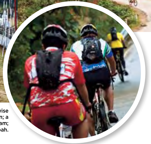
TWISTS AND TURNS Clockwise from above: Biking in Bhutan; a winding trail in north Vietnam; heading uphill in Sabah.