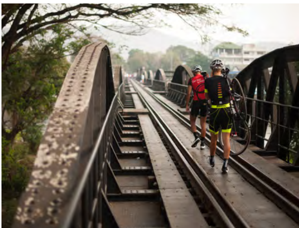
Ahove: At this time of the year many farmers burn their crops to make way for the new season, hence the somewhat hazv backdrop

Left: The iron bridge over the River Kwai is vastly different from what we expected. That'll teach us for believing everything we see in the movies